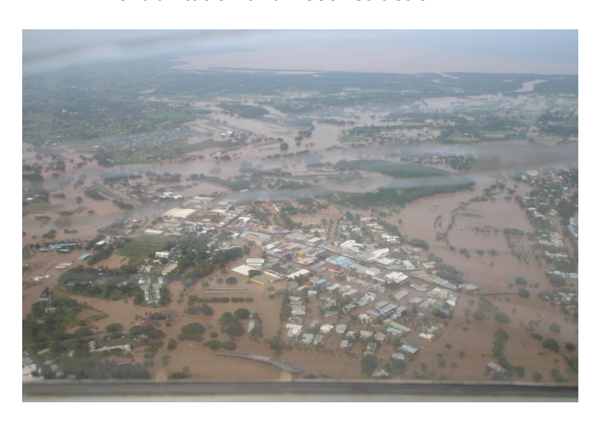
Office of the Prime Minister 17<sup>th</sup> February 2009